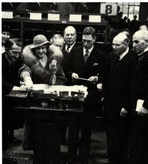
The Duke and Duchess of York applying the special slogan postmark at the opening of Mount Pleasant sorting office, 2 November 1934

OPENING OF MOUNT PLEASANT SORTING OFFICE BY T.R.H. THE DUKE & DUCHESS OF YORK