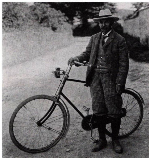
An unusual study of Hardy the cyclist in a country lane in his native Dorset, c.1890.

Our front cover this month features the novelist's signature and a portrait of Hardy, courtesy of the Mary Evans Picture Library.